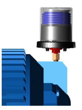
Step 3 – Screw the MEMOLUB® EM lubricator onto the plastic MEMO fitting.